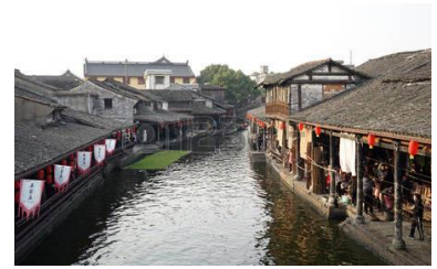
Ancient City of Shaoxing